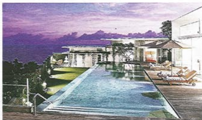
Private paradise ... (clockwise from far left) a Four Seasons residence at Jimbaran Bay; Villa Melissa at Pantailima estate; Nammos Beach Club at Karma Kandara; service at Pantailima; and Karang Kembar Estate.

□ d'Omah: a charming and affordable hotel villa complex of 18 rooms, with lap pool and contemporary Indonesian art, a 10-minute walk from central Ubud, plus the recently renovated four-bedroom Annex to d'Omah. From $US50 a night; see ubudaccommodation.com .